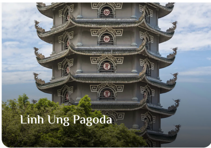
Linh Ung Pagoda