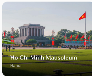
Ho Chi Minh Mausoleum Hanoi