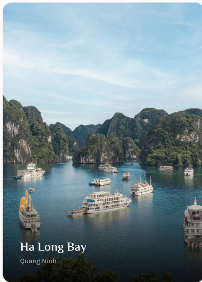
Ha Long Bay Quang Ninh