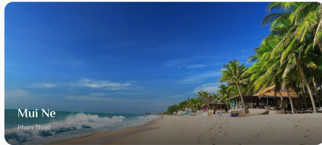
Mui Ne Phan Thiet